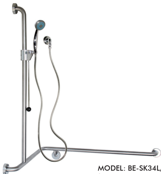
MODEL: BE-SK34L/ESH Left handed model shown